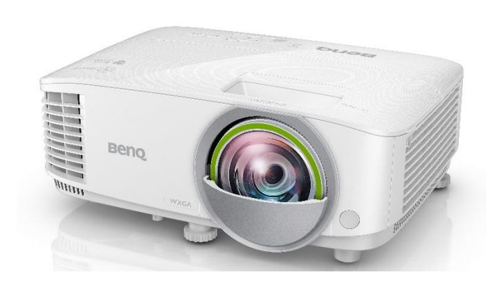
296 (W) x 120 (H) x 250 (D) mm

Introducing EW805ST, an Android-based smart projector designed specifically for education. This all-in-one short throw smart projector comes pre-loaded with EZWrite 6 software that allows for an interactive whiteboard. Teachers and students can open apps directly on the BenQ EW805ST, easily accessing online resources from in the classroom.