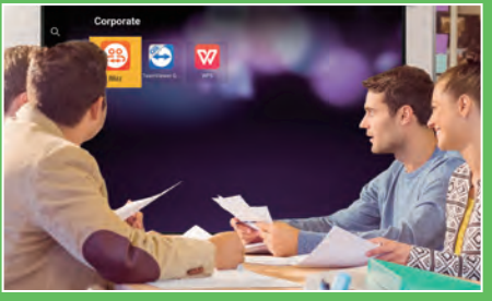
Business Apps at Your Fingertips for